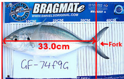
For species with fork, measure to the inner fork