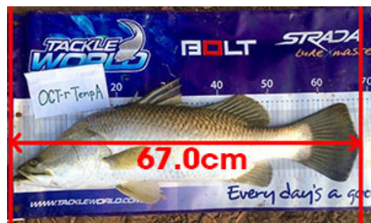
For species without a fork, measure to central tip

·You may enter as many times as you like however you may not enter the same fish more than once.